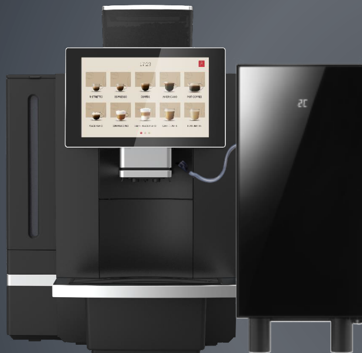
BTC-95 + BMK-4